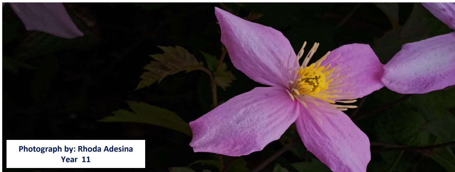
Photograph by: Rhoda Adesina Year 11